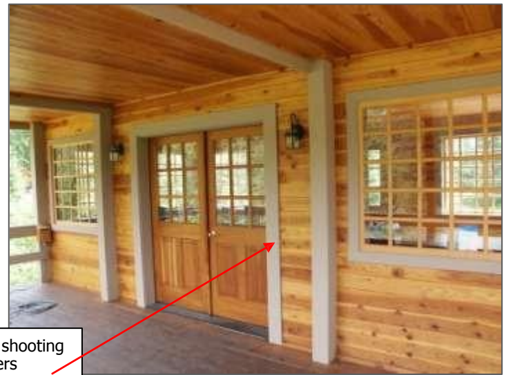
This cabin deck provides the shooting platform, while the cabin offers shelter for waiting wives & children or lunch and refreshments.